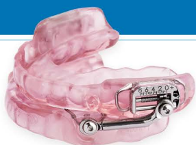
SomnoDent HERBST ADVANCE ELITE*